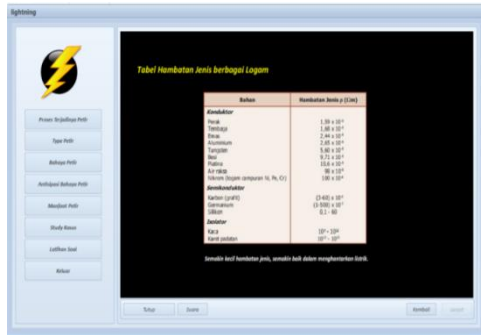
Figure 8. Display of Interpretation Competence of Data and Scientific Evidence

Figure 5 is an animation that explains the phenomenon of the lightning process. This animated show is expected to help students explain the process of lightning starting with the movement of clouds in the air, then rubbing which causes the clouds to become electrically charged differently. As a result of the difference in electrical charge this is what causes the jump of electrons called lightning. While Figure 6 is a show that explains how the electroscope works. If clicked on an image, it will move closer to the head of the charged electroscope so that the leaf of the electroscope will move away if the charge is similar, and move closer together if the electric charge is of a different type. Figures 7 and 8 describe the graph of the relationship between the magnitude of the Coulomb force (F) and the square of the distance between charges (R) and the resistance table of various types of metals. Both of these views require students to be able to interpret data in graphs and tables.