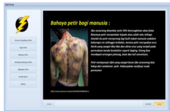
Figure 1. Display of Lightning Danger Context

also useful in producing ozone, so it can reduce the depletion of the ozone layer due to global warming.