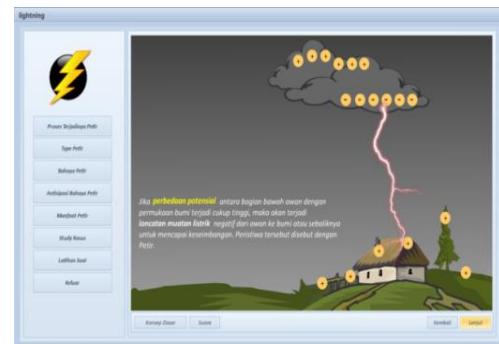
Figure 5. Display of Explain Scientific Phenomenon Competence

These three competencies are also found in lightning multimedia themes as shown in Figure 5, Figure 6, Figure 7, and Figure 8.