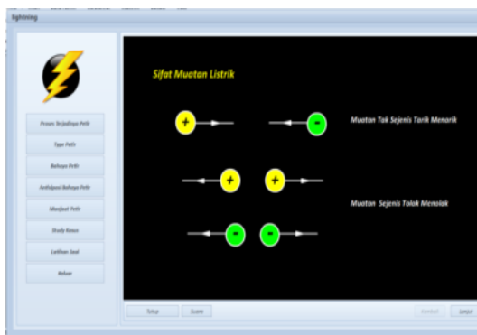
Figure 4. Display of the Nature of Electric Charge.

Figure 3 explains about positive, negative and neutral atoms. Animation about the properties of an electric charge, that is, if a similar charge is brought up there will be an attractive force and if two charges with different charges are brought up there will be a resistive force shown in Figure 4.