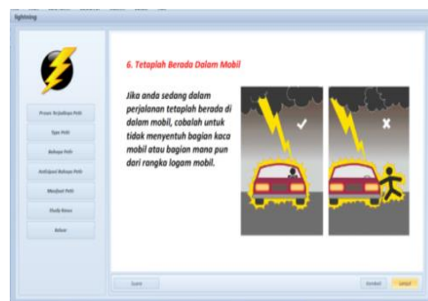
Figure 10. Display of Science Attitude if when Lightning Occurs in A Car

Figure 9 explains that if there is lightning, we should not connect electronic devices with current sources. Also if there is lightning while in the car, we should keep going by closing all the windshields and not touching the conductor parts of the car (Figure 10). In