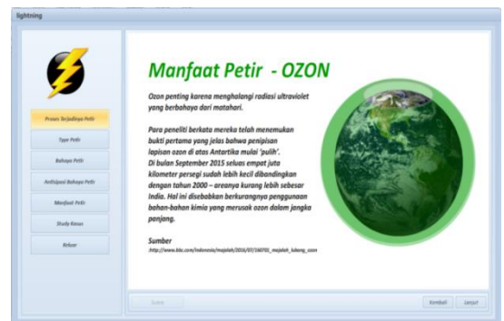
Figure 2. Display of Lightning Benefit Context

The scope of the content domain in multimedia the theme of lightning is the type of atom, the nature of electric charge, static electricity, sound, light, ozone reaction equations, and nitrogen cycle. Examples of display content domain types of atoms and the nature of electric charges are shown in Figure 3 and Figure 4.