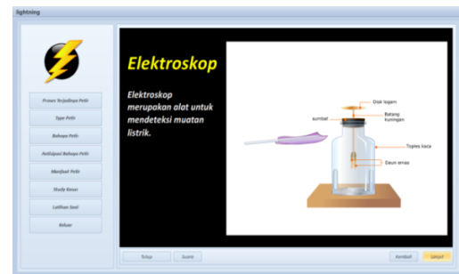
Figure 6. Display of Design Research Competence