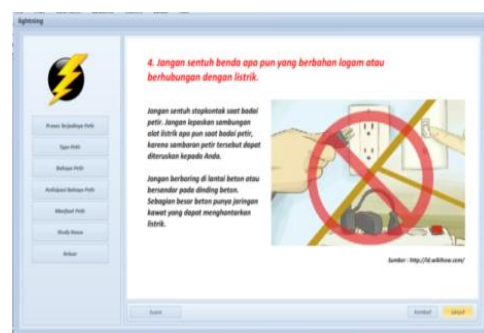
Figure 9. Display of Attitude to Avoiding Science When Lightning Occurs

The domain of scientific attitudes in multimedia learning shows that it aims to increase students' alertness when lightning occurs so that they are free from the dangers of lightning, and even further can use lightning energy. Examples of mitigation to avoid the danger of lightning as shown in Figure 9 and Figure 10.