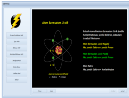
Figure 3. Display of Electrically Charged Atoms